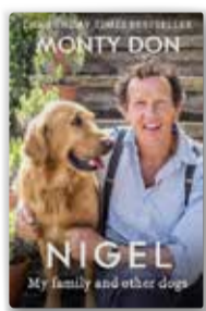
Nigel: My Family and Other Dogs by Monty Don

As one that attaches meaning to objects large and small, this novel promised to be fascinating. I found the story line sweet but not saccharinely so and enjoyed its loveliness for the time of the read.